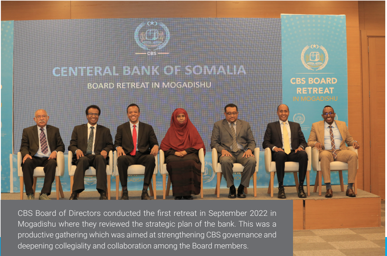
CBS Board of Directors conducted the first retreat in September 2022 in Mogadishu where they reviewed the strategic plan of the bank. This was a productive gathering which was aimed at strengthening CBS governance and deepening collegiality and collaboration among the Board members.